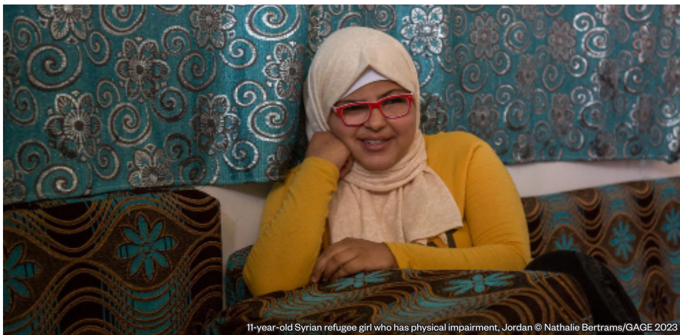
11-year-old Syrian refugee girl who has physical impairment, Jordan

girl with a hearing impairment added that the pandemic even complicated interactions within the home, because 'The battery for my daughter's hearing aid is not available now.'