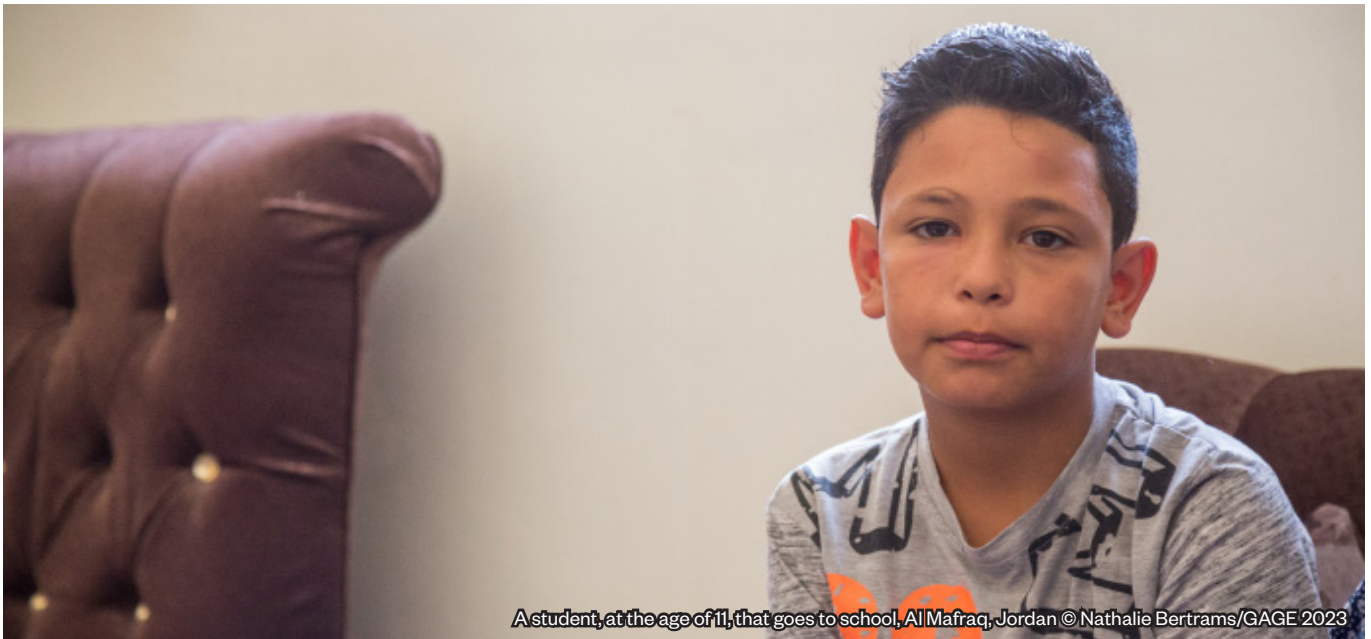
A student, at the age of 11, that goes to school, Al Mafrag, Jordan

happy in my childhood... I didn't complete my childhood... My parents even wanted me to pay for the whole house!' A 15-year-old Palestinian boy, who dropped out in 6 th grade, added that: 'The situation here at the house... is not helpful. There was no money. We, as guys, grew up and it is not right that we stay unemployed.'