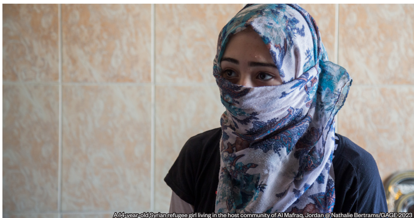
A 14-year-old Syrian refugee girl living in the host community of Al Mafraq, Jordan

GAGE surveys at baseline and during Covid-19 found that Jordanian, Syrian and Palestinian adolescents are similarly likely to be emotionally distressed, anxious and depressed. In part, similarities reflect our purposive sample. At the national level, the poverty rate among Syrians and ex-Gazan Palestinians is many times that of Jordanians, due to lower educational levels and legal restrictions on refugees' employment. In our sample, however, Jordanian households (50%) are very nearly as likely to be severely food insecure as Syrian (52%) and Palestinian (54%) households. To the extent that adolescents' psychosocial ill-being is related to household poverty (which is intergenerational for ex-Gazan Palestinians), our sample effectively hides refugee adolescents' greater risk of distress. In part, similarities between survey findings also reflect Syrian adolescents' greater tendency to under-report-which is driven by their desire to protect their