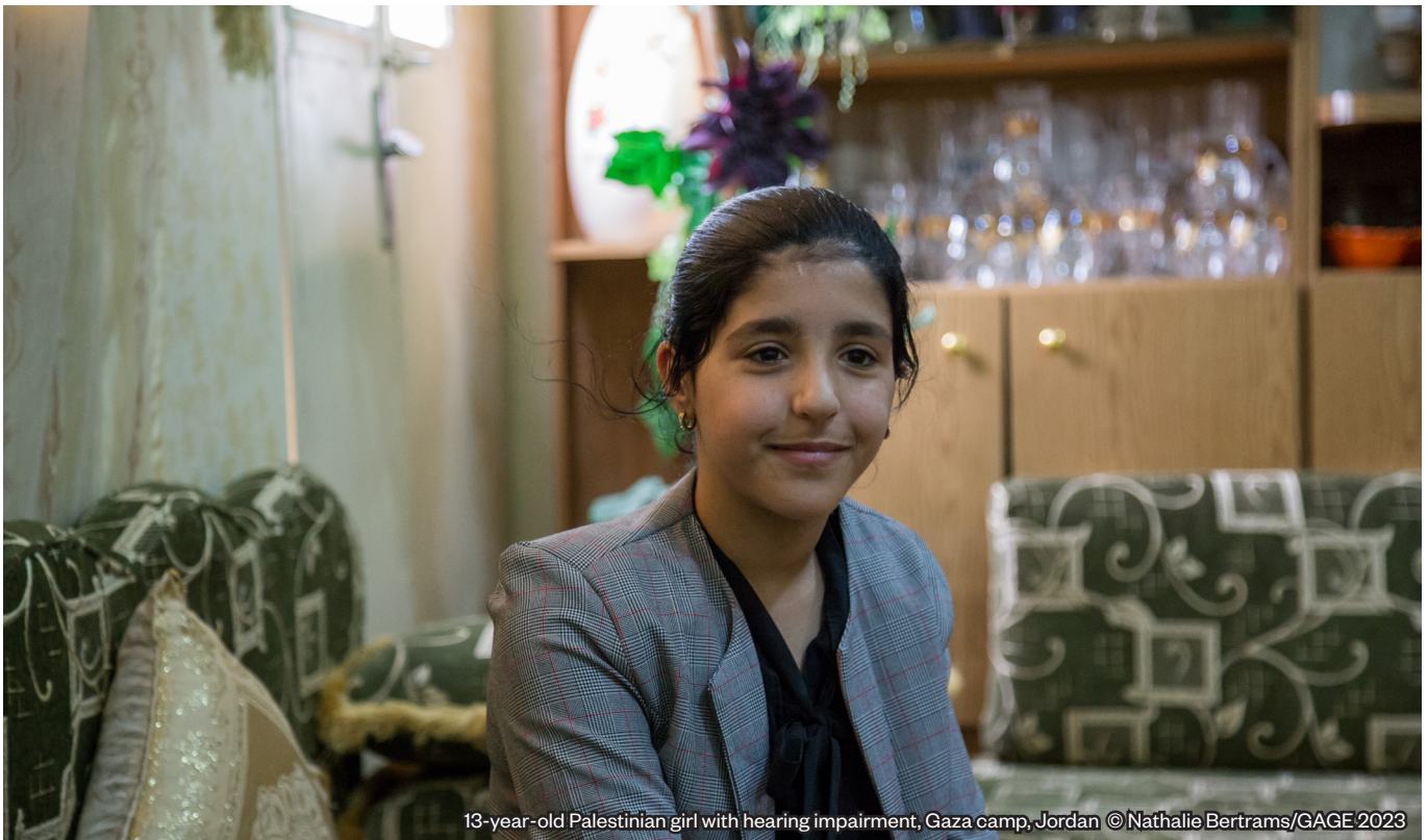
13-year-old Palestinian girl with hearing impairment, Gaza camp, Jordan

use reading, journaling and drawing to soothe themselves after experiencing distressing events, this was rare for boys. Boys were more likely to report calming themselves by playing video games, smoking and drinking (see Box 4). As a 17-year-old Dom boy, who was unable to marry his girlfriend due to her parents' refusal, explained: