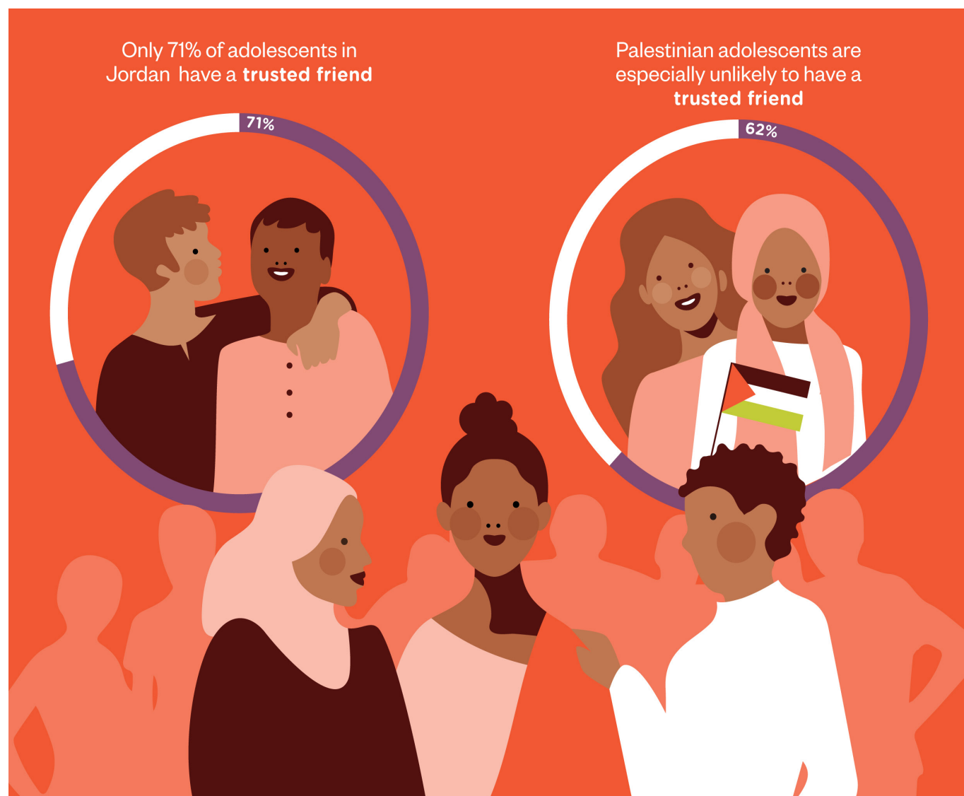
Figure 1: Percentage of adolescents with a trusted friend at baseline

For adolescent girls, the largest source of emotional distress – and the most common barrier to emotional support – is the gender norms believed to protect their (and their family's) honour. These norms cost many girls their access to education, leave others lonely and afraid, and push some into a child marriage that further exacerbates their isolation and risk of violence (see Box 2). Impacts build over the course of adolescence, as expectations regarding girls' behaviour become more rigidly enforced. For example, while the GAGE baseline survey found that younger girls are 8% less likely to leave home daily than